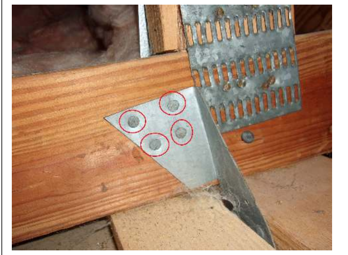
ROOF TO WALL ATTACHMENT – Properly installed Clips

R3 of Florida, LLC P.O. Box 152205 Cape Coral, FL 33915 Office: 239.810.7793 Email: radjrsas@yahoo.com