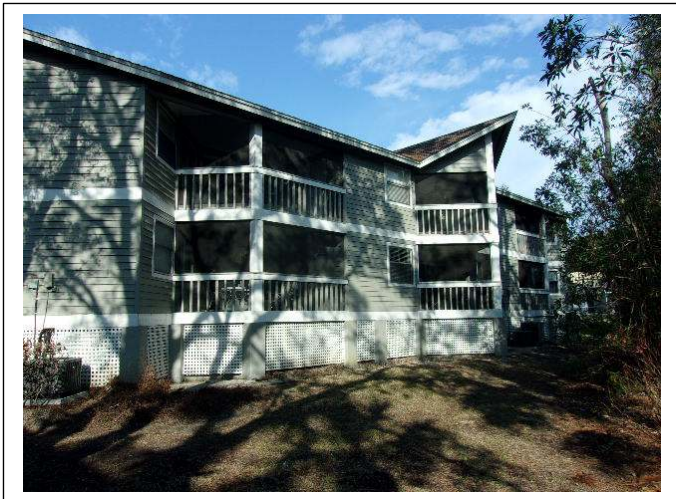
REAR ELEVATION VIEW