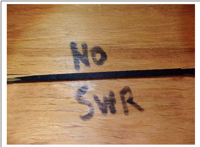
SECONDARY WATER BARRIER – Is not installed