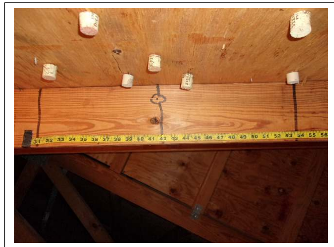
ROOF DECK ATTACHMENT – 8d nails within 12 inches in the field

The Colony at Wiggins Bay Condominium Association 610, 612, 614, 616, 618, 620, 622, 624, 626 & 628 Wiggins Bay Drive 11-18-2022