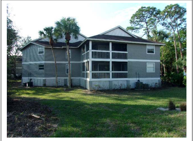
ROOF GEOMETRY – Other/Gable Roof Shape