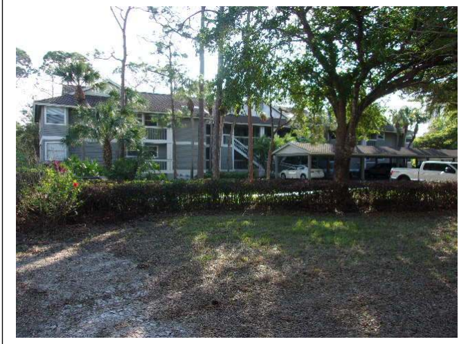
FRONT ELEVATION VIEW

R3 of Florida, LLC P.O. Box 152205 Cape Coral, FL 33915 Office: 239.810.7793 Email: radjrsas@yahoo.com