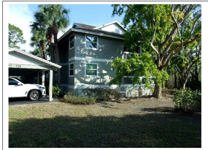
SIDE ELEVATION VIEW

The Colony at Wiggins Bay Condominium Association 610, 612, 614, 616, 618, 620, 622, 624, 626 & 628 Wiggins Bay Drive 11-18-2022