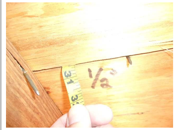
ROOF DECK THICKNESS – ½ inch plywood

R3 of Florida, LLC P.O. Box 152205 Cape Coral, FL 33915 Office: 239.810.7793 Email: radjrsas@yahoo.com