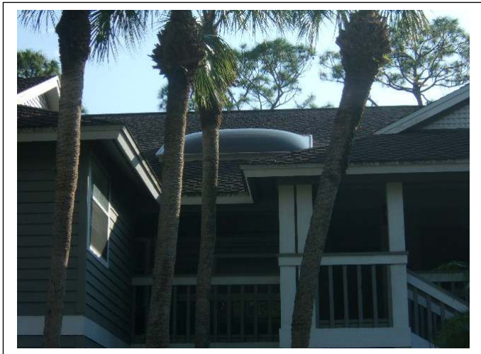
OPENING PROTECTION – The skylights are not rated or protected